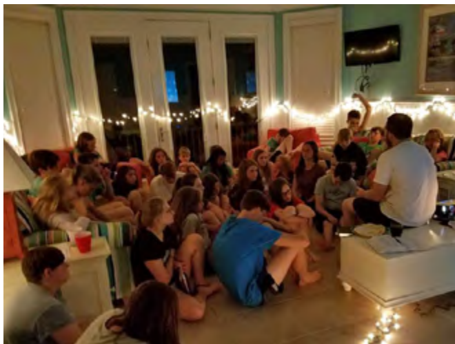
Youth Beach Retreat 2018

The story of KBC.ym in 2018/19 has just begun, but already it's off to the races. We began the big adventure at Holden Beach on Labor Day weekend, with a retreat to remember. We filled a gigantic house with laughter and brought back good memories of a weekend spent together. Do days get any better than when they begin with a walk down the beach at sunrise? While the sand fleas may have unleashed a plague of bites upon us during our last evening there, it was still a weekend to remember.