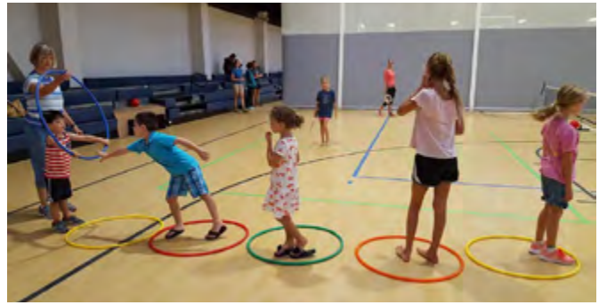
Children play games in the gym, organized by the Children's Ministry.

working on laptops and trying to meet work deadlines that weren't budging for the weather. Other parents helped supervise in the gym and still more were sweeping sequins off the floor and wiping up spilled glue. A grandmother got down