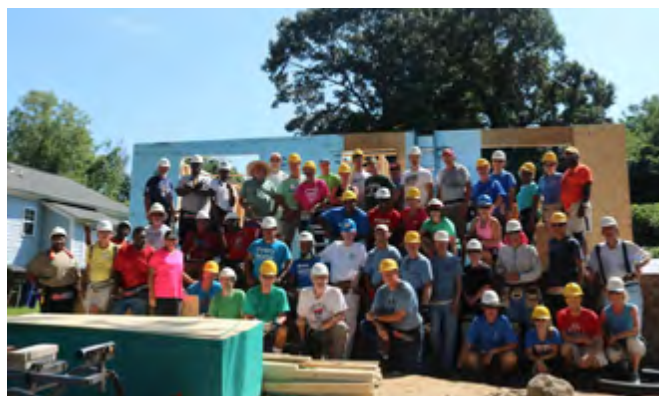
Volunteers from different faith groups worked on the 2017 Faith Build.