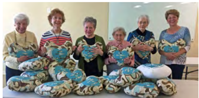
The Sew & So's with pillows for Forsyth Medical Center heart patients

Our current need is for monetary donations to help offset the cost of new sewing materials. The sewing kits will be sent to third-world countries where sewing skills open doors to additional income that can help a family make ends meet. The assembled kits will be given to programs that teach sewing or tailoring and provide the tools to make and mend clothing or to begin a business.