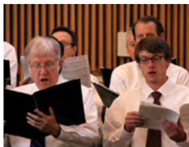
Men's Choir, March 2017