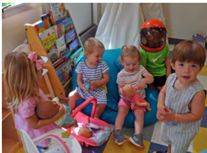
Children enjoying the Imagination Station