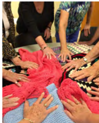
The Sew & So's pray over handmade shawls given to shut-ins.

Our current need is for monetary donations to help offset the cost of new sewing materials. The sewing kits will be sent to third-world countries where sewing skills open doors to additional income that can help a family make ends meet. The assembled kits will be given to programs that teach sewing or tailoring and provide the tools to make and mend clothing or to begin a business.