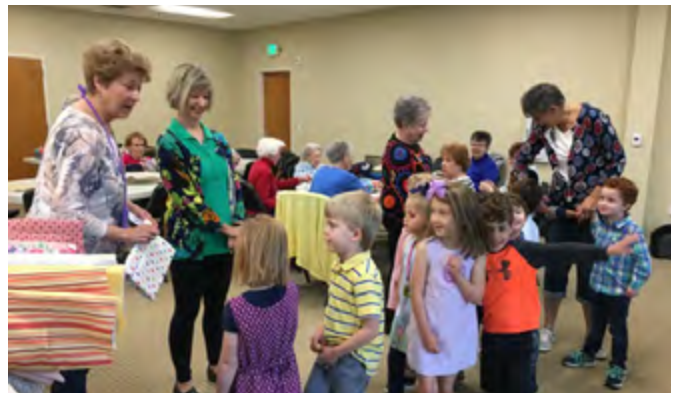
The Through-the-Week school children come to visit the Sew & So's.

Sign up this month after Sunday worship and on Wednesday nights. You may read more about the seven teams on www.knollwood.org/ministries/knollwood-cares