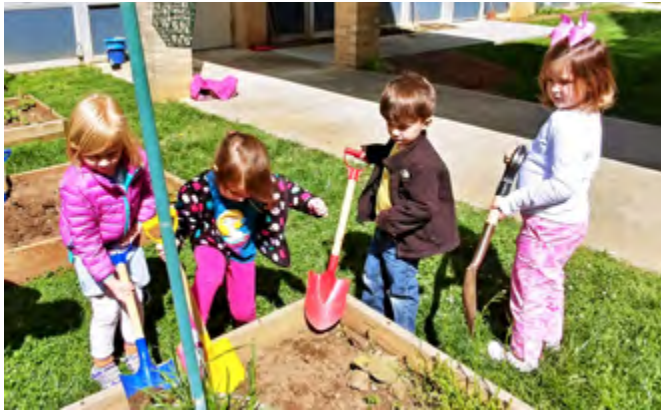
Preschoolers preparing the soil for our garden

planted flowers. Check them out when you come to church.