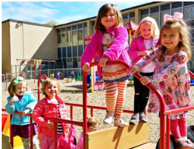
Preschoolers enjoying the warm, sunny days on the playground.